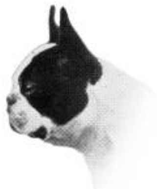
Photo by Thos. Fall, U.K., the Countess of Essex's imported Million Dollar Boy Blue.

Sari Tietjen affirms that this is also true for the Chin: “The Japanese Chin standard calls for the muzzle to be ‘short and broad with well-cushioned cheeks and rounded upper lips that cover the teeth.’ Although it does not specifically say that the teeth and/or tongue must not show, it is implied as a dog would not have the proper finish and look desired for the breed.” The Pug standard does not address whether or how the lips cover the teeth, or whether or not the teeth or tongue may show, but Pug breeder and Toy judge Charlotte Patterson said, “The teeth or tongue should never show on a Pug when the mouth is closed. If they have the proper ‘slightly undershot’ bite they will never show teeth or tongue.”