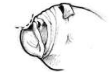
Short Headed - Lacking Thrust of Jaw