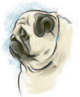
Illustration Tom Kimball.

Muzzle – Very short, with the nose well laid back... Jaw – Square, broad, and deep, and well turned up... Nose – Large (...) with large, wide open nostrils. Bite – slightly undershot; teeth not to show.