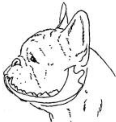
From the FBCA Illustrated Standard: "Correct lower jaw upturn."

From the AKC standard for the French Bulldog: